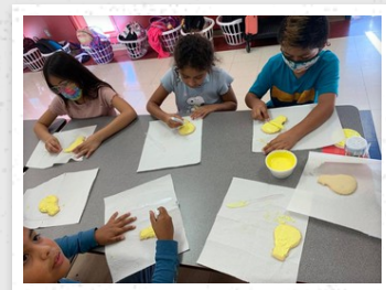
ACE at Red Rock Elementary