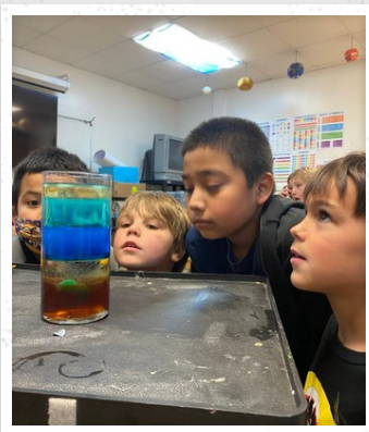
ACE at Bluebonnet Elementary