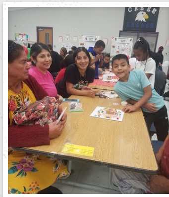
ACE at Cedar Creek Elementary